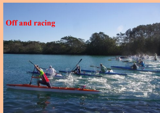
Off and racing